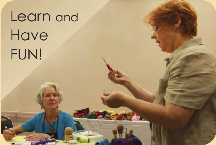
Learn and Have FUN!

The Embassy Suites has a corporate rate for their guests with the St. Louis County Cab/St. Louis Yellow Cab Co. From the hotel to the airport , the fee is $20 flat (no per person charge). IMPORTANT: Use code 9150. From the airport to the hotel , the fee is $23 flat (includes a $3 airport fee). IMPORTANT: Use code 9151. Reach the cab company by dialing "24" from the airport courtesy boards located in baggage claim. Please mention account #9151 to receive the discounted rate. Cabs are usually in the area, so the maximum wait is 10 minutes. Cab dispatch phone number is 314-991-5300.