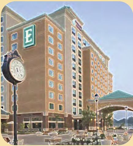
The St. Charles Embassy Suites Hotel

Make the decision to attend this hotel suite market!